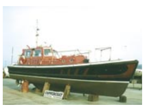
42ft GRP pilot vessel - UK.

Hard-wearing Coppercoat<sup>®</sup> gives longer service intervals, allowing vessels to stay in-water and stay working, with obvious economic benefits.