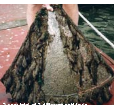
3 year trial of 3 different anti-fouls. Coppercoat<sup>®</sup> is in the centre

Coppercoat<sup>®</sup> uniquely provides lasting protection against marine fouling whilst secreting very low levels of biocide. With a leach rate of less than 50micrograms/cu/cm2 after 30 days, Coppercoat<sup>®</sup> complies with the requirements of even the most tightly controlled locations, such as the states bordering the Baltic and, in the USA, California. Consequently a vessel treated with Coppercoat<sup>®</sup> can sail freely in all waters of the World, and given the hard-wearing longevity of the coating, the dream of circumnavigating the globe on a single treatment of anti-foul is now a reality.