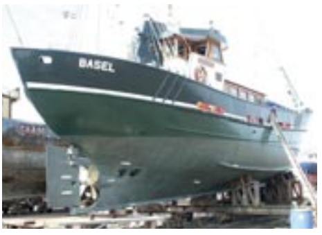
70ft steel fishing boat - Ireland.

Aquarius Marine Coatings Limited Unit 10, St Patrick's Industrial Estate Shillingstone, Dorset DT11 0SA