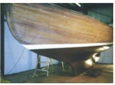
Wooden XOD sprayed for racing finish. Your local Coppercoat® Distributor: