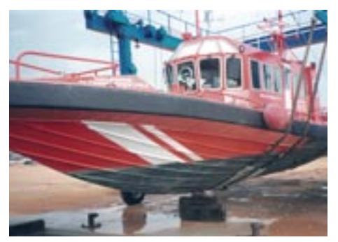
36ft aluminium patrol boat – Spain.