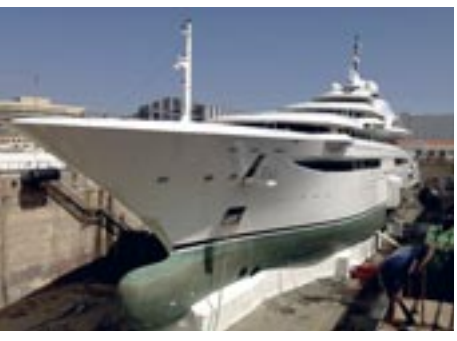
410ft steel megayacht – Abu Dhabi.

Aquarius Marine Coatings Limited Unit 10, St Patrick's Industrial Estate Shillingstone, Dorset DT11 0SA