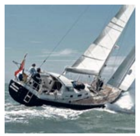
Coppercoat® treated 'Arearea' at Cowes Week.

Coppercoat<sup>®</sup> is suitable for DIY application by roller and by being non-conductive can be used (with the appropriate primer) on all surfaces including GRP, cast iron, steel, wood, ferrocement and aluminium.