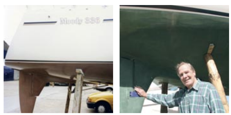
For those looking to minimise maintenance costs and extend coatings service intervals, Coppercoat<sup>®</sup> can provide the solution.

Below left Yacht "Nicklathyse" was treated with Coppercoat<sup>®</sup> in 1994. Below right In 2010 the owner of "Nicklathyse" celebrated 16 years of not having to re-anti-foul his boat!