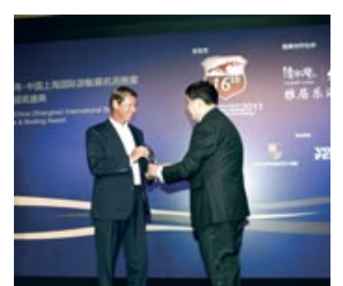
The MD of Coppercoat ^{\ensuremath{\$}} Hong Kong accepts the eco-friendly award

In 2011 we were delighted to receive the "Most Eco-Friendly Business" Award at the China (Shanghai) International Boat Show, making Coppercoat® an award-winning and responsible choice.